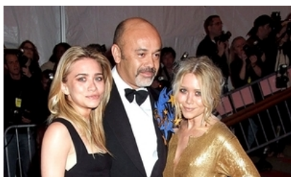
Christian Louboutin: Winner of the Outstanding Designer Achievement Award at the Luxury Law Awards